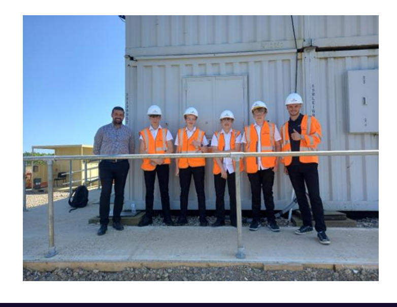
Chelmer Valley High School Site Visits x2

Over the course of the project, we have helped several local organisations in a variety of ways through social value and sustainability events to meet the commitments we promised at the outset. Below are examples of some of the events.