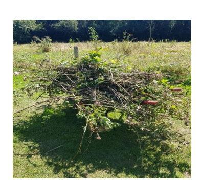
The Conservation Volunteers – Danbury Common & Highwoods Country Park

Kid's Inspire, Hampers, Toys & Cheque Donation